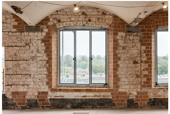
Internal brickwork repair and replacement. Historic England.