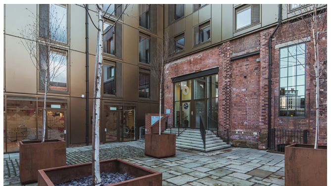
Thermal upgrades with bronze aluminium cladding