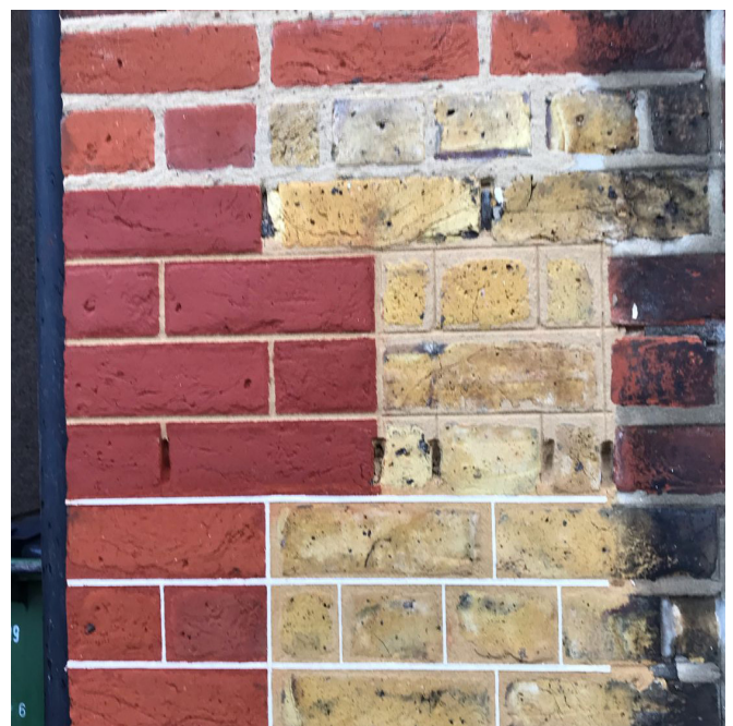
Sample panel prepared for repointing.

The particular mix of mortar should be chosen in relation to the exposure of the walling (or paving) in question and guidance on this selection is given in the BDA's 'Mortar for Brickwork' document.