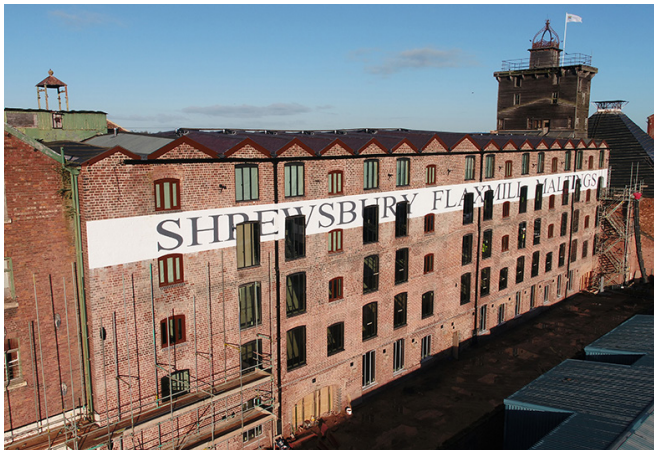
Shrewsbury Flaxmill Maltings - Built 1797. Historic England.

Low rise residential masonry construction is particularly well suited to refurbishment, which means that housing stock can be altered with the changing demands. It should be noted that refurbishing a building that is not 'fit for purpose' due to structural stability or fire safety is unlikely to be the most sustainable solution in the long term.