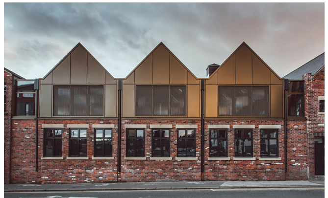
Alsop Fields, Sheffield. Mixed use development

Retrofitting is mostly used in relation to the installation of new building systems, such as heating systems, but it can also refer to the fabric of a building, for example, retrofitting insulation or double glazing. Brick manufacturers have developed a number of systems that can be used to overclad existing solid wall masonry buildings. It is important that a holistic approach is taken, including ventilation, air permeability and heating.